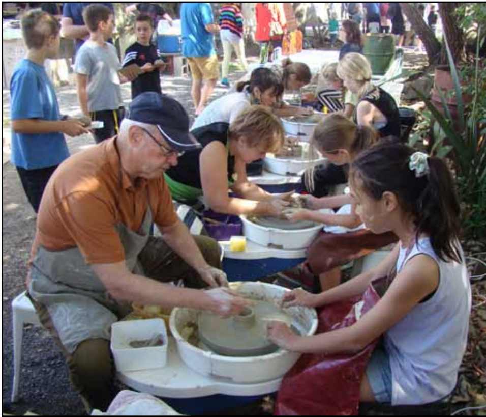
What it's all about: having a go at the Big Clay Day Out For more photos, visit www.facebook.com/aspnz/